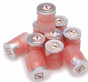
Dosicap Zip allows for exact, non-contact dispensing of freeze-dried reagent.

Continuous environmental stewardship is the other high priority in the development of the TNTplus Vial Tests. The small volumes required for TNTplus tests minimize the amount of chemicals and hazardous substances used.