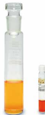
Cuvette tests use 90 % less chemicals than traditional methods.

On top of that the Dosicap system was developed to make adding solid reagents to the vial as simple, as safe and as reproducibly precise as possible. The required amount of reagent is freeze-dried in a vial cap. When the reagent needs to be added the Dosicap is screwed on the vial and the solid reagent is dissolved only after the vial is safely closed again.