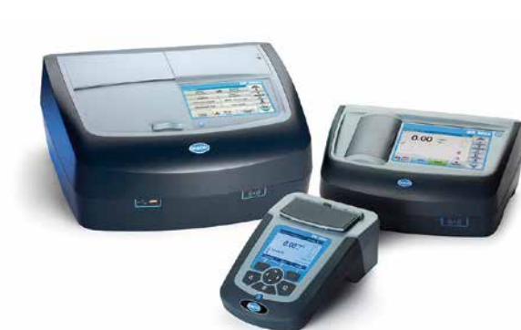
Spectrophotometer range from portable to UV-VIS

Hach supports AQA by offering single and multiparameter standard solutions, test filter sets for photometers and Service Programs for preventive instrument maintenance.